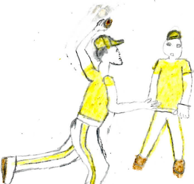
Draw a picture of some visitors who have come to Jamaica from far away.

Do you want to make any comments about this drawing?